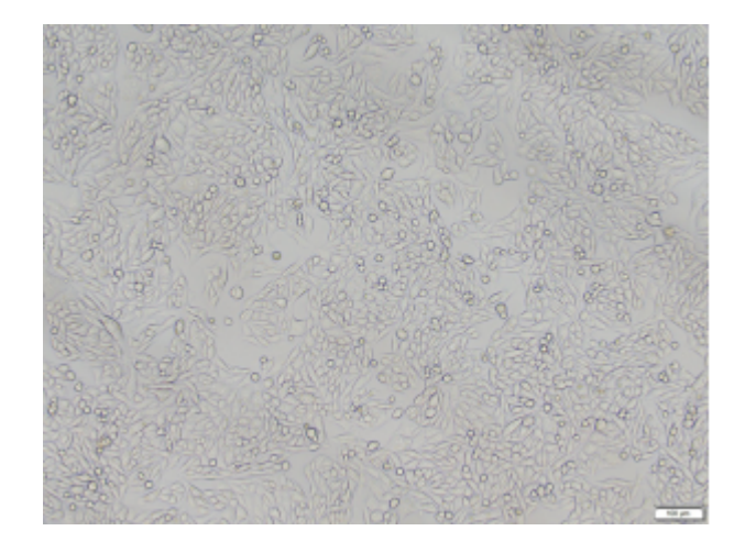
Fig1. Morphology of Renca cell line.