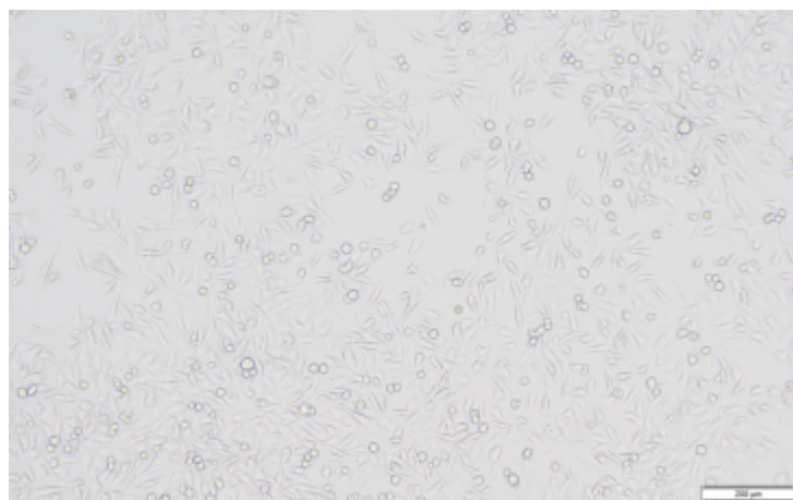
Fig1. Morphology of PC-3 cell line.