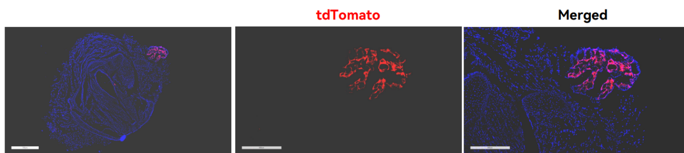
Fig2. Cre-mediated recombination in thyroid of Pax8Cre/+; Rosa26tdTomato/+ mouse.