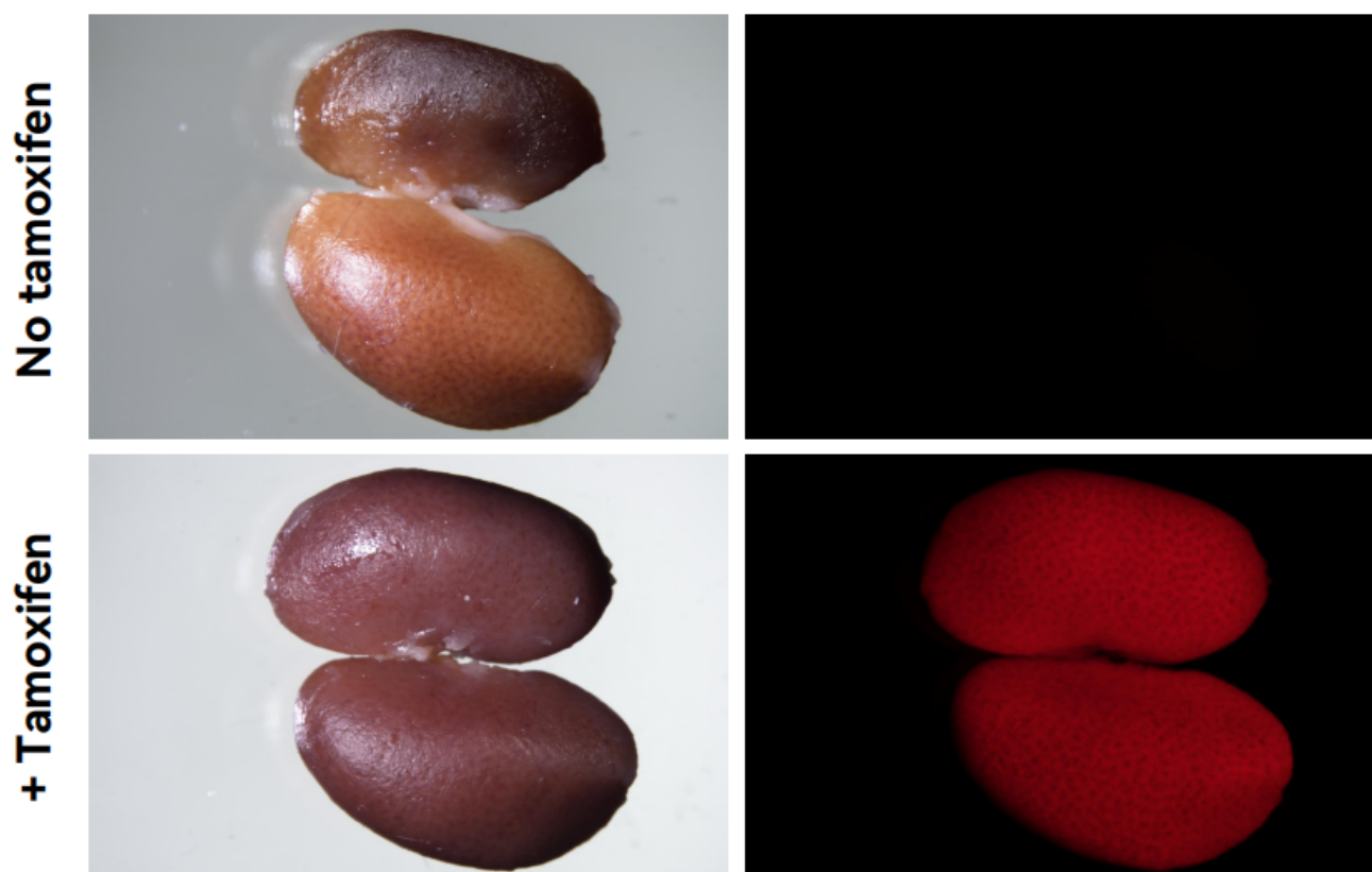
Fig1. CreERT2-mediated recombination in kidney of Slc34a1^{CreERT2/+} ; Rosa26^{tdTomato/+} mouse.