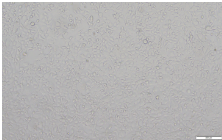
Fig1. Morphology of EBC-1 cell line.