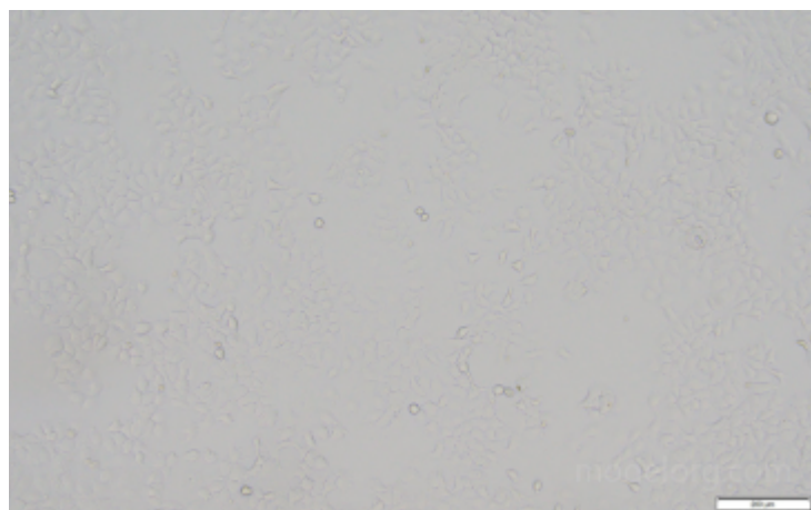
Fig1. Morphology of MCF7 cell line.