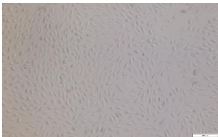
Fig1. Morphology of A-498 cell line.