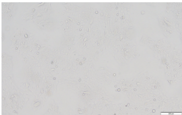
Fig1. Morphology of Cal 27 cell line.